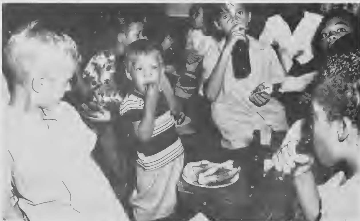
EVERYONE SEEMS to be having a good time during the treat. The members really had a holiday, since even the cleaning-up of plates and bottles was done by the Legionnaires.